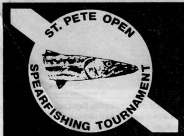
The official insignia of the spearfishing tournament.

✓ ✓ ✓ The scuba column invites questions, story ideas, diving activity schedules and comments in general. Write to Jack Belich, The St. Petersburg Times , P.O. Box 1121, St. Petersburg, Fla. 33731.